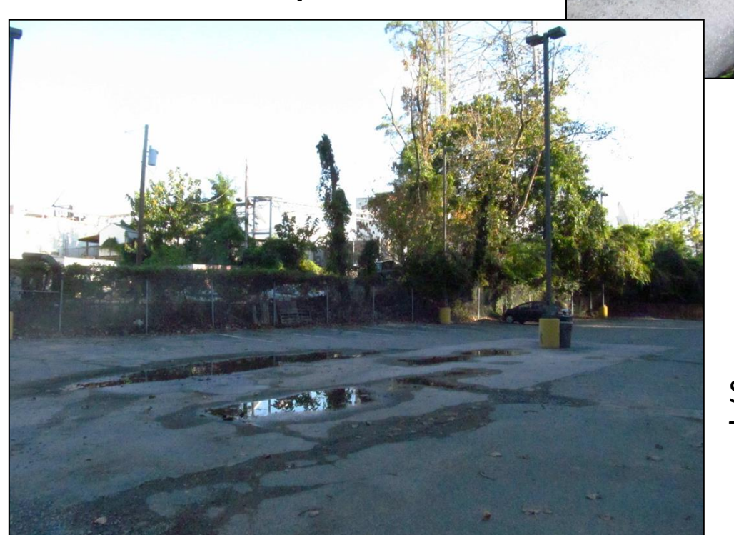
Looking downstream at the Willett Branch from the bridge

South Bank – Visitor parking lot for Towers Apartments.