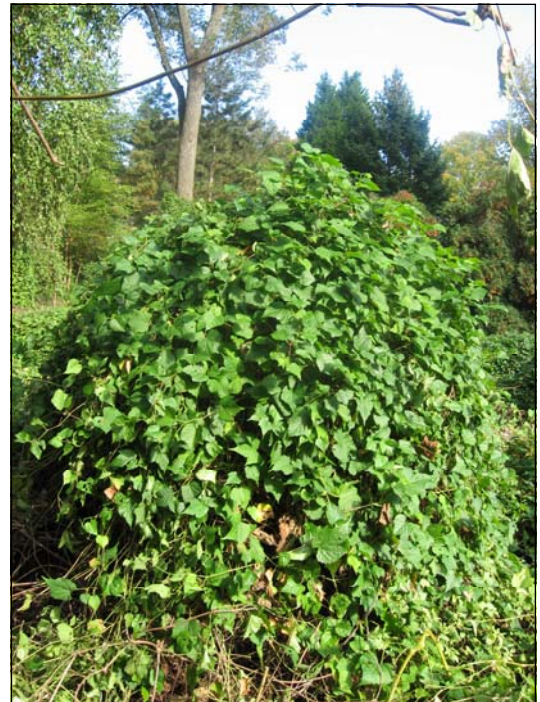
Volunteer frees a tree - above before, to the left after!